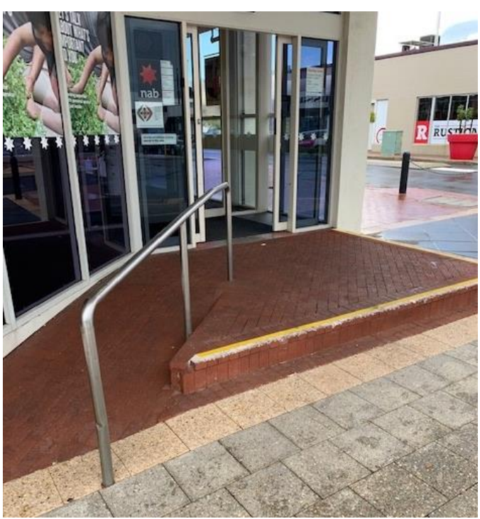
Above: A bank with an unacceptable stepped entry point.