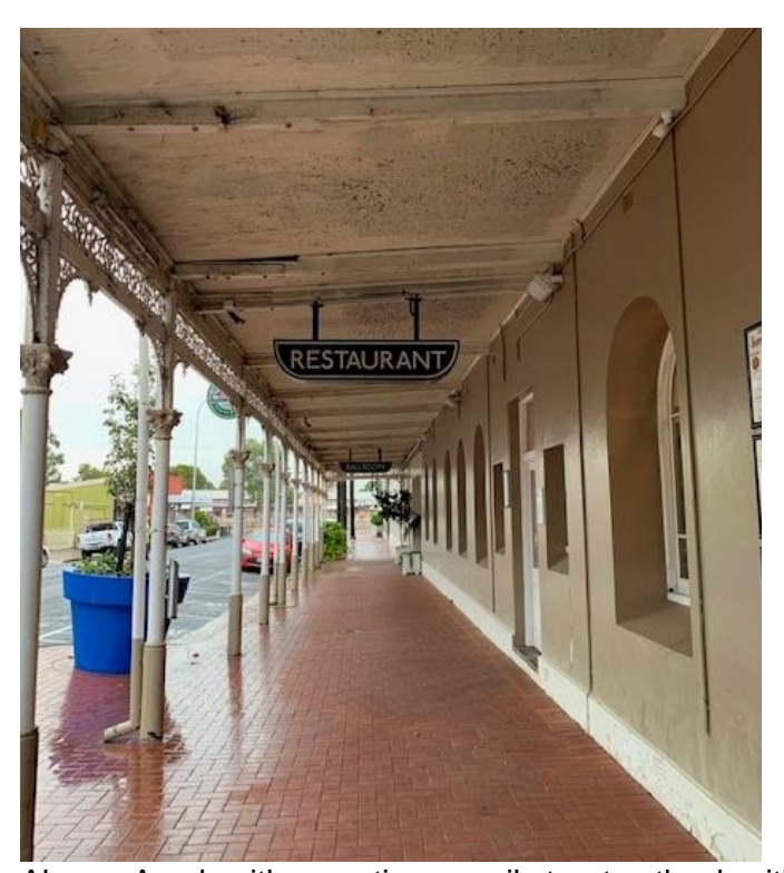
Above: A pub with a continuous nil street setback with a verandah over the footpath.