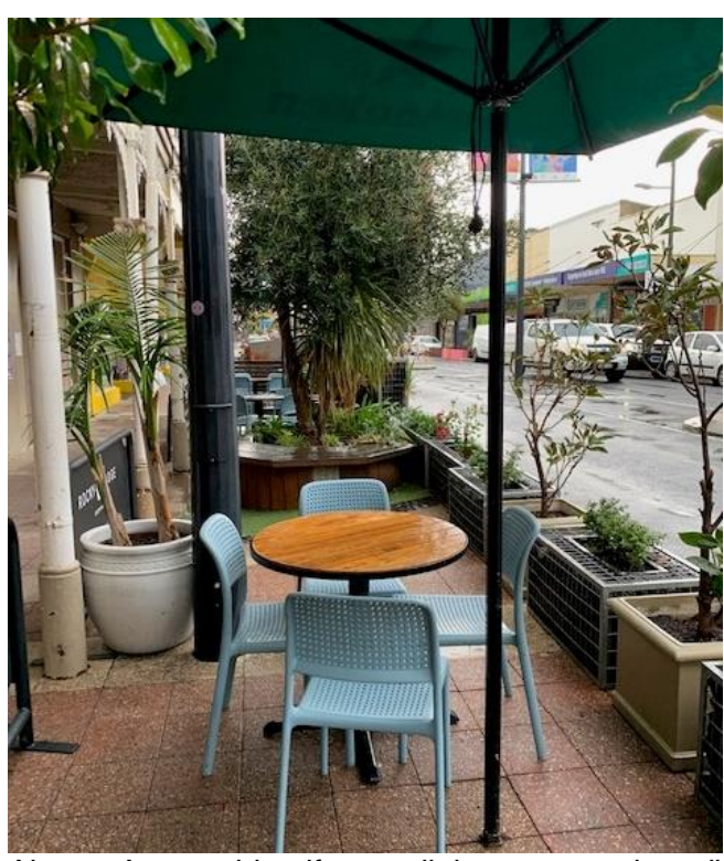
Above: Acceptable alfresco dining area on the adjacent footpath.