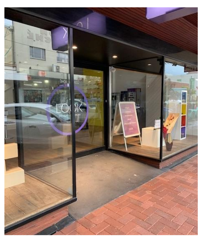
Above: A shop frontage with a recessed entry point and adequate glazing.