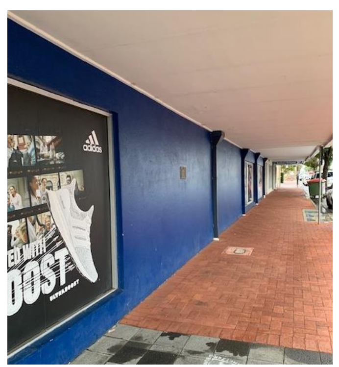
Above: A shop on a corner that fails to adequately address the secondary street architecturally.