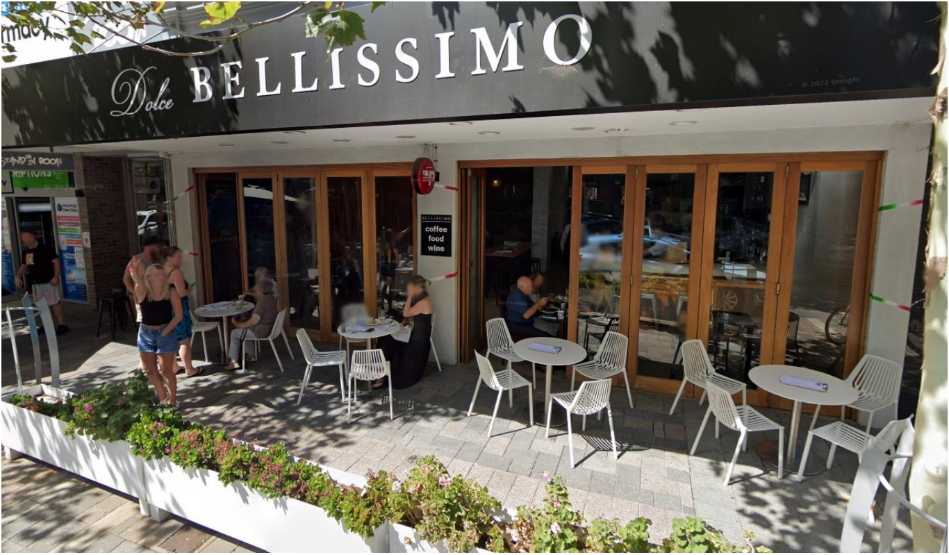
Above: Restaurant with an acceptable facade, a nil setback to the street, an overhanging verandah and alfresco dining. The entrance should be recessed.