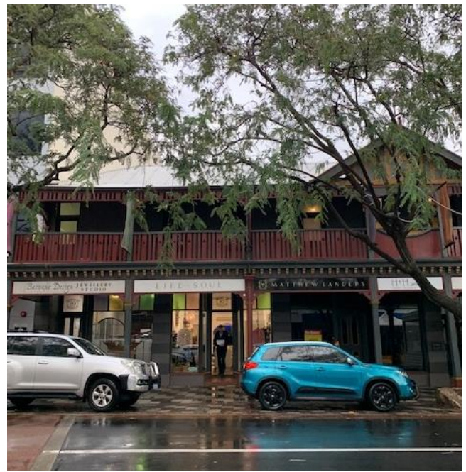
Above: A shop on ground level and offices with associated balconies overlooking the street on the upper level.