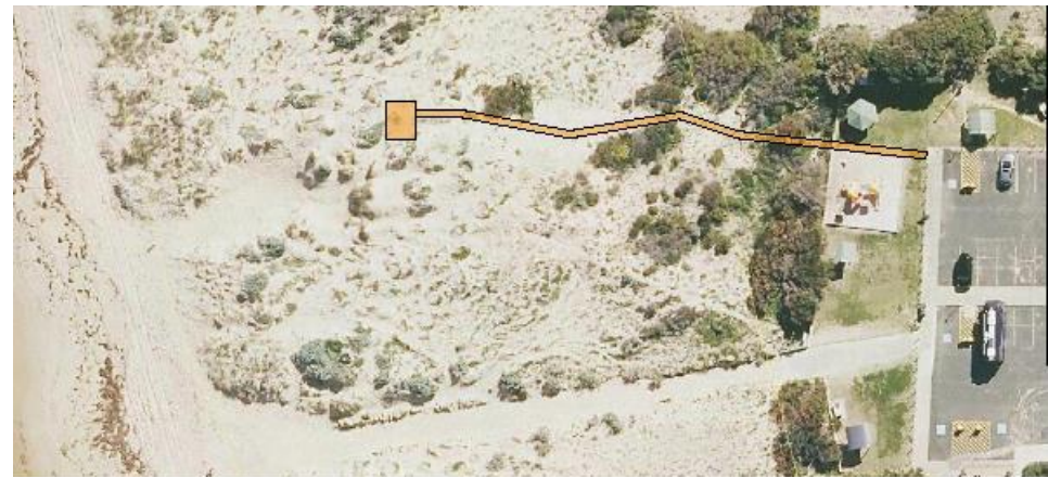
Figure 1. Option 3E site plan for viewing platform

In this option a boardwalk connects from the car park area to a location in the dunes north of the beach access track, suitable for viewing the ocean. A preliminary design for this option has been developed previously.