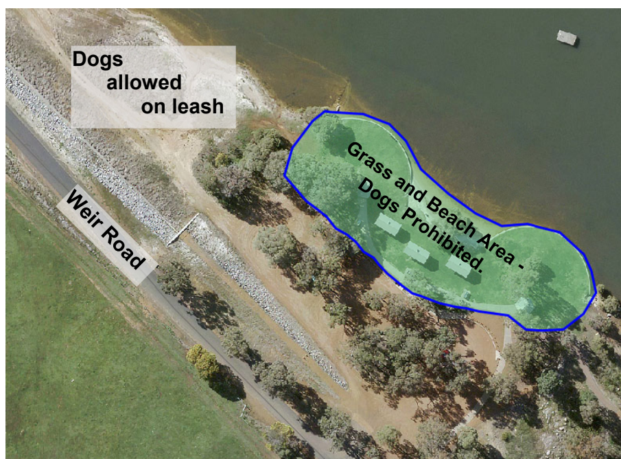
Image 1. Drakesbrook Weir, Weir Road.