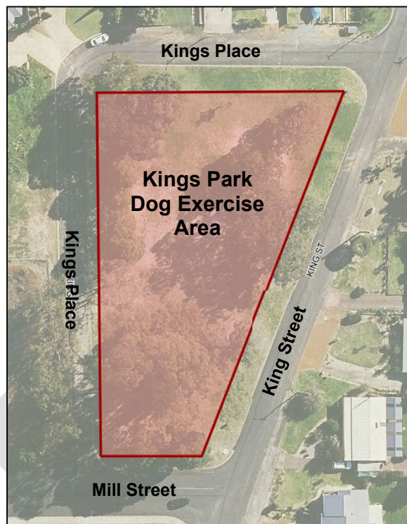
Image 3. Kings Park, Waroona