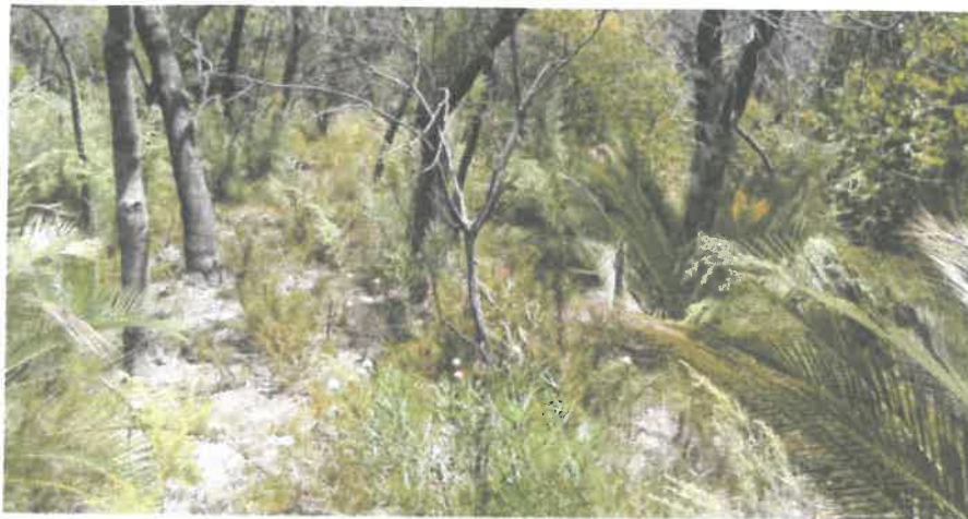
Plate 1: 'Very Good' vegetation showing native understorey with mid- and upper strata regenerating following fire (32.8634 S, 115.8229 E ).