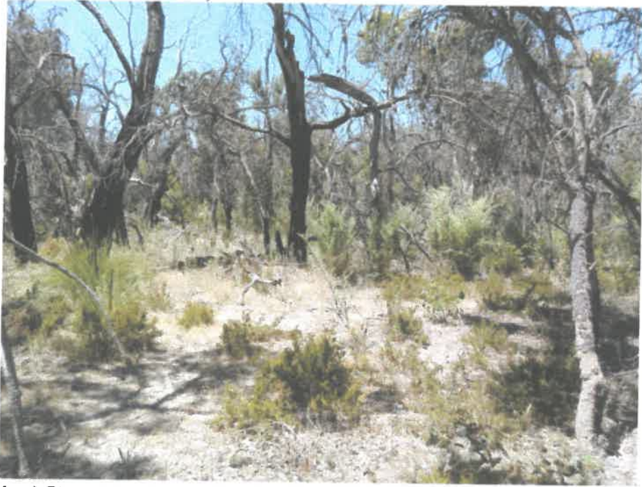
Plate 4: 'Good' vegetation with a weedy understorey and some native species, but vertical structure is still present (32.8589 S, 115.8227 E ).