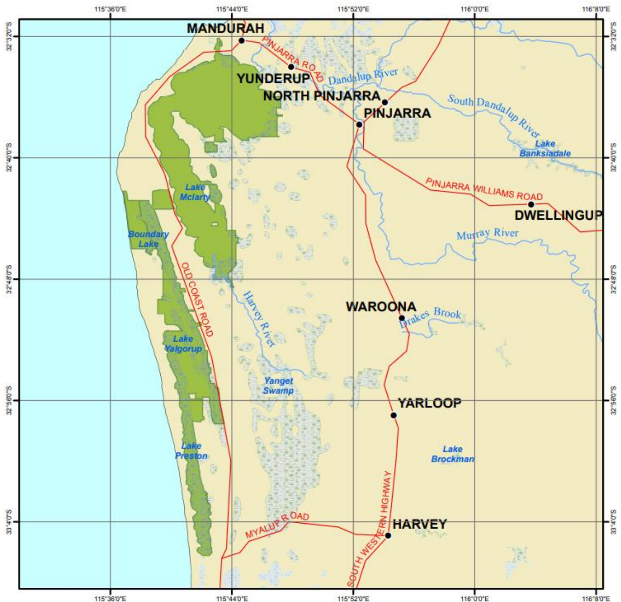
Figure 2. Peel-Yalgorup System, showing Ramsar Wetland in Green

While bringing power across the Ramsar wetland either below or above ground is technically feasible, the environmental considerations for this route are significant given the groundwater issues and the fragility of this ecosystem. There already exists a desalination facility in Binningup with pipe infrastructure already traversing from ocean to land.