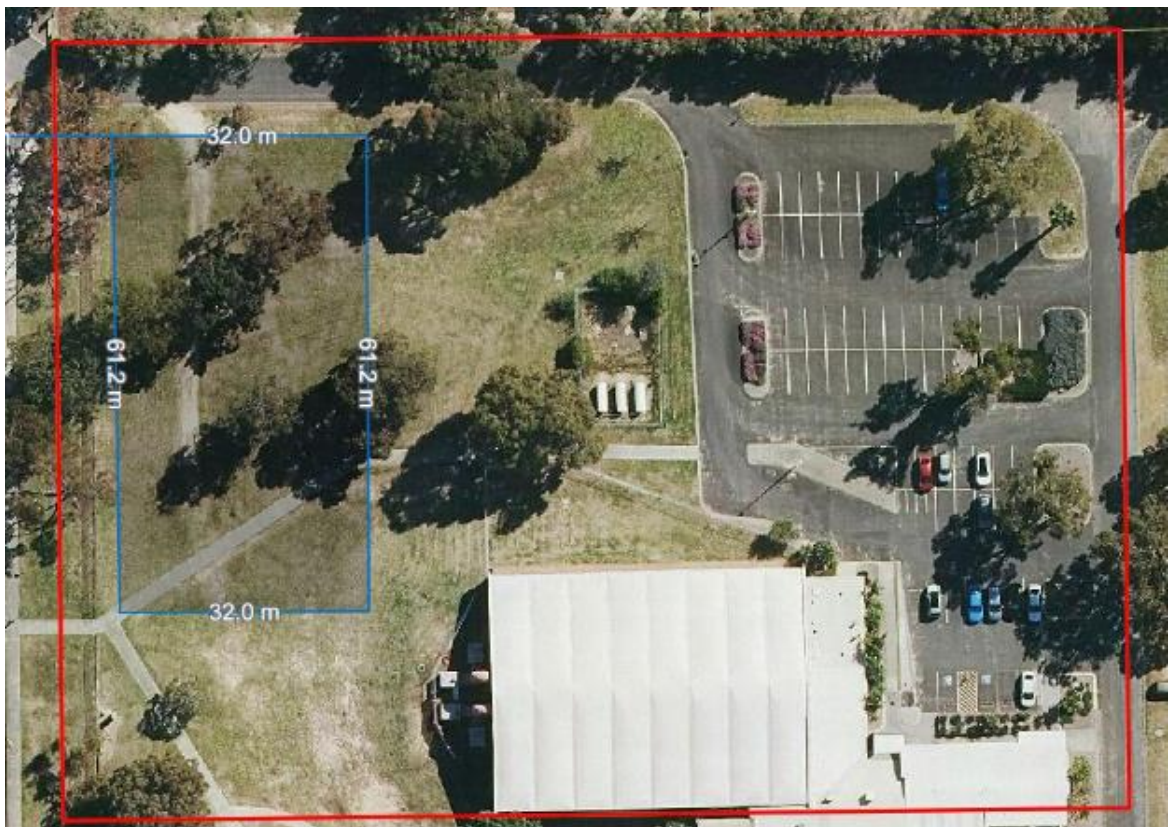
Image 1. Proposed location of croquet facility.

The support from council and the confirmation of the desired location will allow the club to begin planning the project. This will include finalising project costs and determining a funding strategy to ensure the project can go ahead. Guaranteeing the land for 5 years will allow sufficient time for the club to plan the project and commence work if the project is deemed feasible.