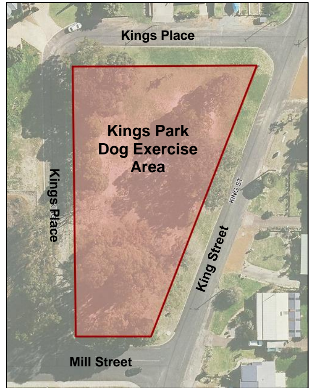
Image 3. Kings Park, Waroona