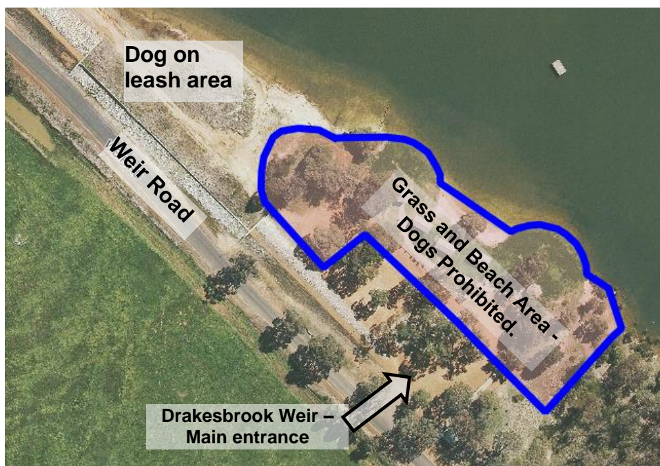
Image 1. Drakesbrook Weir, Weir Road.