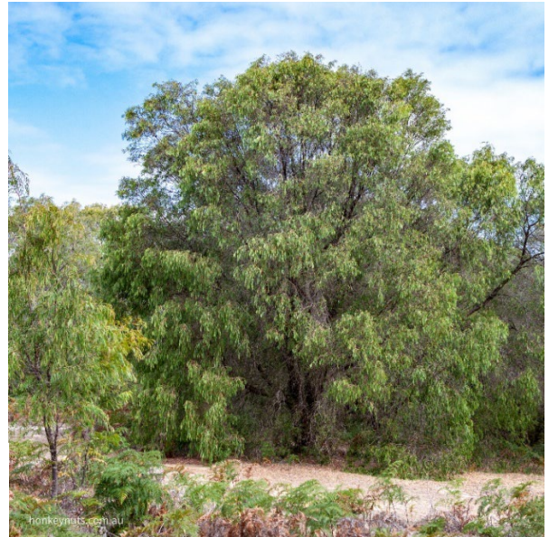
Above (left and right): Examples of vegetation requiring approval for clearing